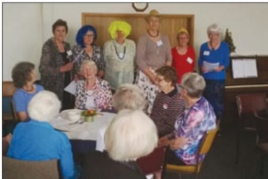
Nativity members perform Cinderella.

The Nativity Evening AAW Group Blenheim hosted the members of the recessed Afternoon Group and some St Christopher's ladies to an old fashioned afternoon tea so out came the embroidered tablecloths and best china. Two thought provoking readings, a skit and Christmas Carols interspersed with a lovely afternoon tea and Christmas Cake made for an enjoyable occasion.