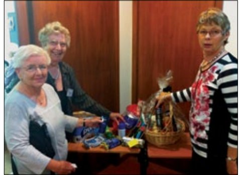
Gifts and household articles collected for the Men's Emergency Shelter