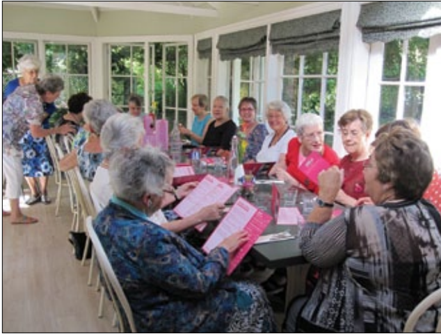
Belfast-Redwood AAW at breakfast

Special Greetings of the season, brothers and sisters throughout the land. May your times of peace and joy far outweigh your times of busyness and stress.