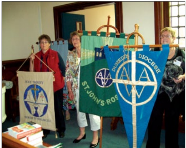
Beginning the Banner parade