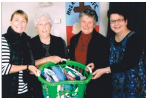
St Christopher's ladies giving Hope House mangers some gifts

At Marlborough's Regional meeting the members heard of the establishment, in Blenheim, of "Hope House" under the umbrella of the "Bread of Life Trust". 'This facility is for young pregnant teens who will have an opportunity to continue their education. The Hope House team will provide them with a number of essential life skills to run a home and enjoy their baby. If the baby is adopted there will be support offered throughout the process. If a teen keeps her baby, she will need support to limit severe hardship, limited finances and to develop skills. Each teen mum will be provided with support and encouragement, life skills, ante natal classes, GP visits and exercise programmes.' The AAW members had brought along toiletry items which they presented to the Bread of Life Trust members who were delighted.